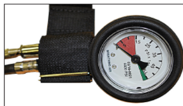
FIGURE 17 Remote Gauge (Model 4.5 gauge shown, other models similar)