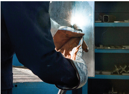
All position welding