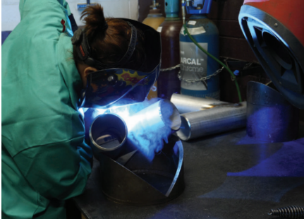
MIG welding of stainless steel

The high-performance welding gas solution for all stainless steel MIG applications