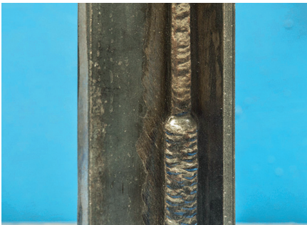
Multi pass welding – vertical up