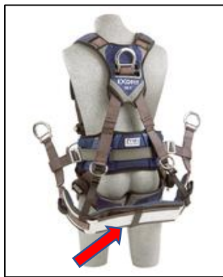
Representative Seat Sling Indicated by Red Arrow

3M Fall Protection has received reports that the aluminum reinforcement plate used in the seat sling on certain DBI-SALA ExoFit™, ExoFit XP™ (inc. Arc Flash), and ExoFit NEX™ (inc. Arc Flash) harnesses can become dislodged from the webbing. In a few instances, the aluminum seat plate has separated from the harness and fallen to the ground, creating a potential dropped object hazard. There have been no reports of injuries or accidents associated with this condition. The performance of the harnesses is unaffected by this issue—they will perform properly in all respects, including as body support for a personal fall arrest system in the event of a fall, even without the added comfort offered by the seat sling.