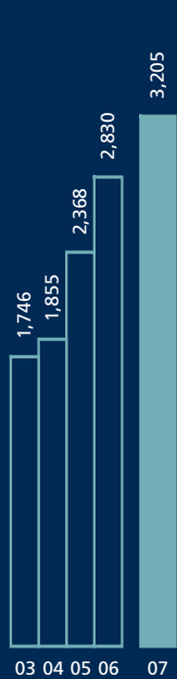
Net Sales (In millions of dollars)