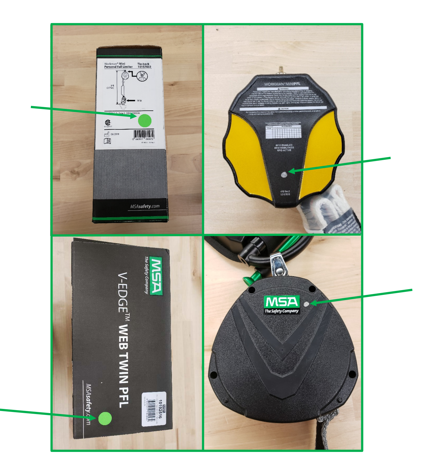
Figure 1 – Markings on MSA Inspected Product