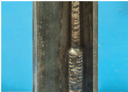
Multi pass welding – vertical up