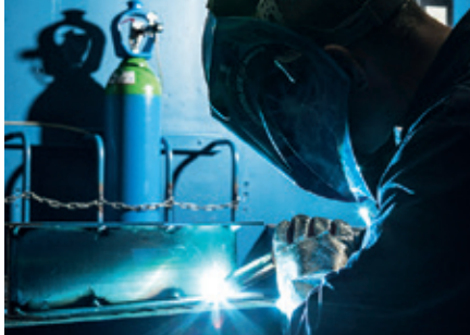
MIG welding of aluminum

The high-performance welding gas solution for TIG and MIG welding of all materials