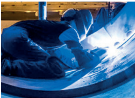
TIG welding of stainless steel