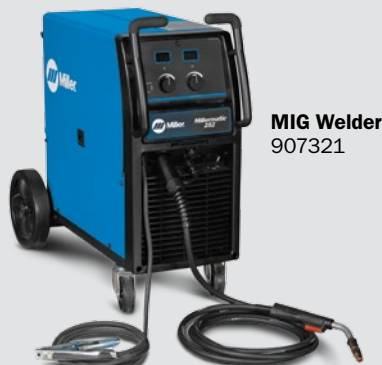
MIG Welder 907321