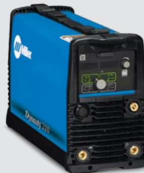
TIG Welder 907685