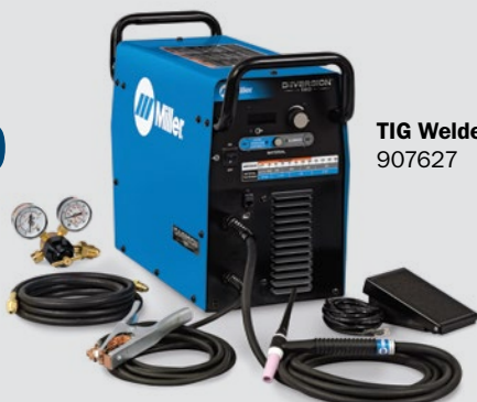
TIG Welder 907627