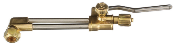
CA2460 CUTTING ATTACHMENT