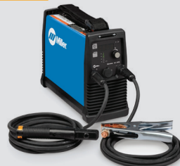
TIG Welder 907710