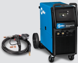
TIG/Stick Welder 951684