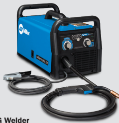
MIG Welder 907614