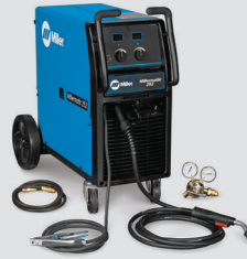
MIG Welder 907321