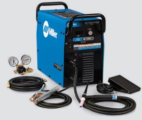
TIG Welder 907627