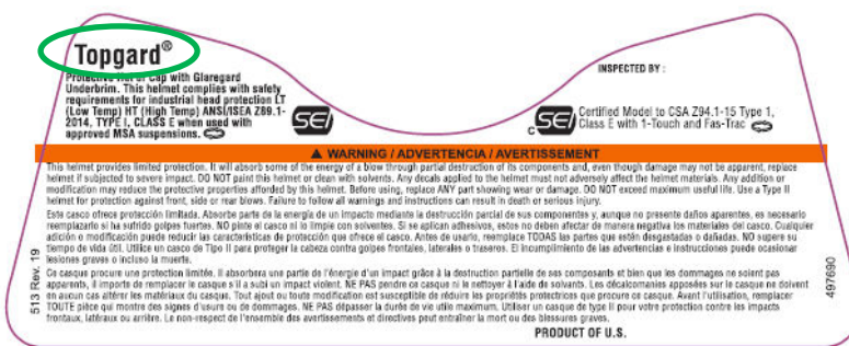
Topgard Helmet Label Located Inside Helmet Shell

To identify affected helmets, check that the helmet shell is white and a cap style, with a brim only in the front. Also check that the label inside the helmet shell confirms that it is a “Topgard” model, as shown below. Then, check the shell mold date emblem on the underside of the helmet brim, as indicated in the photo below. If the shell was molded in January 2017 or February 2017, the helmet is affected and should be removed from service and replaced. All other helmet models, colors, and shell mold dates are not affected.